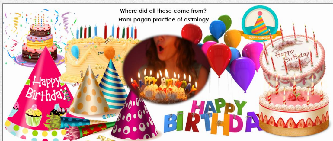
Figure 1: The practice of birthday celebration originated from the ancient practice of astrology. Over time, this practice has evolved and became shaped into what we have today. The birthday that people celebrate today is no different from what was started in ancient times. The symbols and the practice itself, all link to astrology and spirits of other gods.

Before people drink water from a downstream source, most people often consider the upstream source of that water—whether it is clean or not. People are very careful when it comes to the physical food they consume; people are keen to ensure they don’t eat something harmful. When it comes to spiritual food, why are people reluctant in investigating upstream sources of spiritual foods?