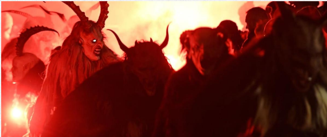
Figure 15: Christmas Krampus demons pre-Christmas celebrations—a practice God hates; Thou shall not do so unto the Lord thy God.

Krampus—who is Krampus? Krampus (see Figure 15 ) is a demon: half-goat and half-man, who appears yearly and chases disobedient and heady children. In some extreme cases, Krampus may take rebellious children to hell. In Europe, Krampus is believed to be a scary counterpart of Saint Nicholas. Krampus and Saint Nicholas originated from the celebration of Winter Solstice. Mainly in Europe, Saint Nicholas visits children around 5-6 December to reward them. At the same time, Krampus would visit them too but with punishment. In certain parts of the world—mainly Europe, men would dress as Krampus and Saint Nicholas and throw street celebrations where some children are rewarded, and some are punished. These practices are deeply rooted in paganism and not holy; it offers worship and homage to the Babylonian spirits. Thou shall not do so unto the Lord thy God.