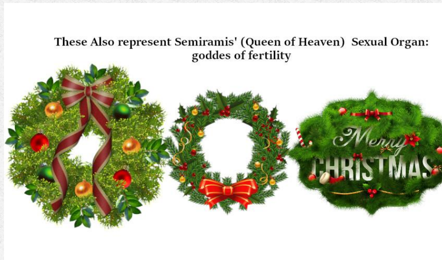
Figure 14: This represents the female sexual organ and symbolises fertility. This has nothing whatsoever to do with Jesus Christ. God commands against this practice.

They are used to decorate places of worship of the sun god. People who create wreaths and place them on their doors believe the evergreen wreaths represent the everlasting life brought through Jesus Christ, and the circular nature is considered to represent God with no beginning and end. The reality is, this explanation is just a sticker on pagan practice; this is an attempt to Christianise a pagan ritual. Wreaths are associated with fertility and the “circle of life”; they represent the sexual organ of Semiramis—the fertility goddess. These are things related to the worship of false gods.