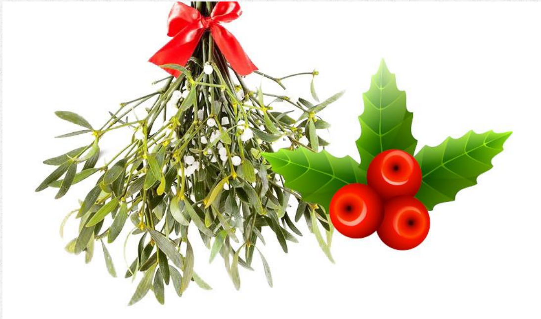
Figure 9: The mistletoe is a sacred plant and a symbol of fertility among the pagans. Semiramis is the goddess of fertility, and this pays homage to the fertility goddess; this has nothing to do with Jesus; it offers worship to other gods.

associated with fertility and the “circle of life”. These are things related to the worship of false gods. The mistletoe is a parasitic plant that lives on oak trees, and the Druids worship it (see Figure 9 ). It was also used as a herbal remedy for barren animals and symbolised fertility, like rabbits and eggs in Easter.