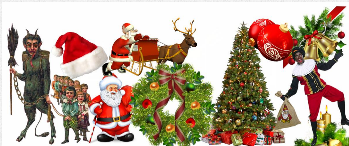
Figure 7: Idolatrous Christmas symbols—all of pagan origin. These symbols offer worship to other gods—the Babylonian spirits.

Will you use symbols that offer worship to idols in your home or church? Most people set up these symbols in their homes and churches without knowing what they are doing. Learn the truth and don't do things blindly. Choose whom you will serve—the Devil or the true God. The very things Christ was born to destroy (the works and symbols of the Devil) are the same things people are setting up in their homes and churches—How ironic!