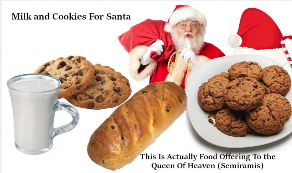
Figure 6: Milk, cookies, and bread offered to Santa. This practice originates from the tradition of offering food to the Queen of Heaven (Semiramis—mother/wife of Tammuz). God hates this practice and commands His children to abstain from it ( Jeremiah 7:18 ).