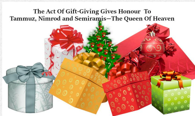
Figure 12: The practice of gift-giving during Christmas originates from the celebration of Saturn and other gods. Giving gifts itself is not a sin, but because it is done in honour of the sun gods—that's where the problem is.

This practice originates from the celebration of Saturnalia, and other feasts celebrated around the same period. This practice pays homage to other gods and not Jesus. People lay their gifts under the Christmas tree and wait until December 25 before opening them to see what they got; this practice gives worship to Tammuz, Nimrod, and Semiramis. People have cleverly found a way of justifying this practice by using the three Wise Men that gave gifts to Jesus. Using the Scriptures (three wise men giving gifts) to justify this practice is another example of pasting a Christian-sounding name on something God hates. There is nothing wrong with sharing gifts, but when gift-giving is done in honour of the Christmas sun god, then that's where the problem comes in. When something good is done to honour other gods, it becomes offensive to God. Laying gifts under the Christmas tree is the worship of other gods (see Figure 12 ).