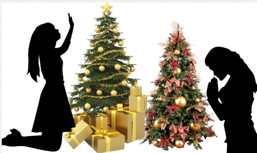
Figure 4: The tradition of setting up Christmas trees originates from the Babylonians; the Egyptians got it from the Babylonians and passed it to the Romans; the Romans passed it to the Germans; the Germans passed it to the world. This is a practice that honours the sun god Tammuz, Nimrod. It has nothing to do with Jesus Christ; Jeremiah 10:1-5 says don't do it!

The Christmas tree and all other related traditions (see Figure 4 ) are ways of the heathen, and God commands against it: Do not learn their ways. Learning these ways is sin; talk less of using these ways to worship God. The pagans use these trees as phallic symbols to represent their pagan gods. Some people ignorantly believe and teach that God has sanctified Christmas and associated traditions and made it holy—is this true? This is another lie from the father of lies—the Devil. God will never take pagan ways and make them holy and then call them His ways—God will not do that—God will not contradict himself. God has never sanctified Christmas and will never do so. Learn not the way of the heathen ( Jeremiah 10:2-4 ); setting up Christmas trees goes against the commandments of God in Jeremiah 10:1-5 and Exodus 20:3-5 .