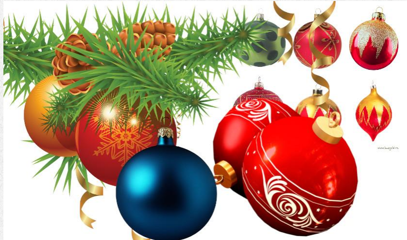
Figure 13: Ornaments on Christmas tree offer worship to other gods and idols. It has nothing to do with Jesus.