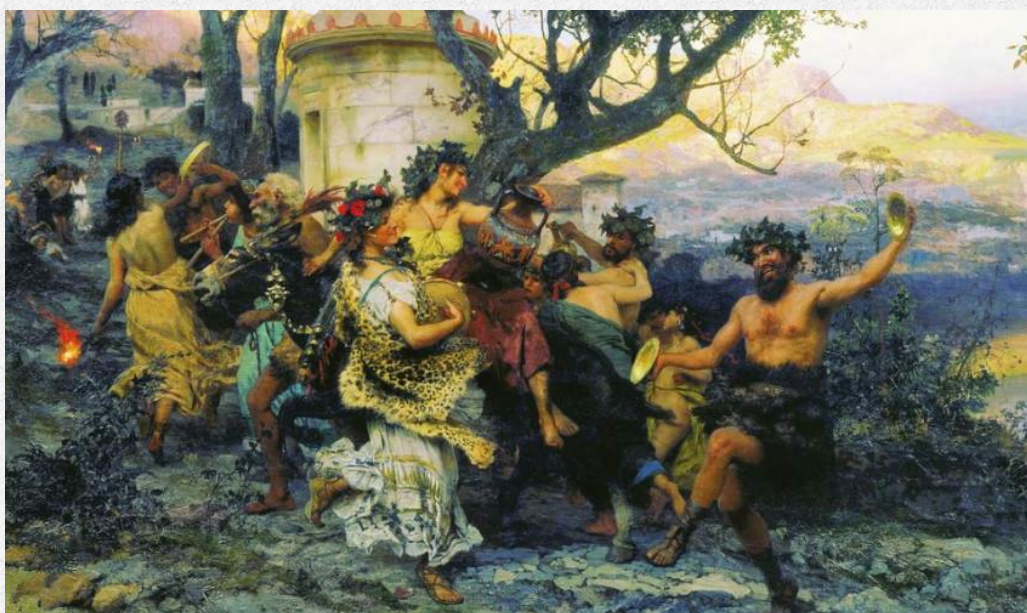
Figure 3: The feast of the Roman god Bacchus. Bacchus was the god of agriculture, wine, and fertility. This god is equivalent to the Greek god Dionysus. The feast of Christmas integrates all the practices involved in the celebrations of these gods.

Other Winter festivals like the Brumalia offer worship and sacrifices to Saturn, Cronus, Demeter, and Bacchus (see Figure 3 ). Celebrations usually run from November 24 th to December 23 rd .