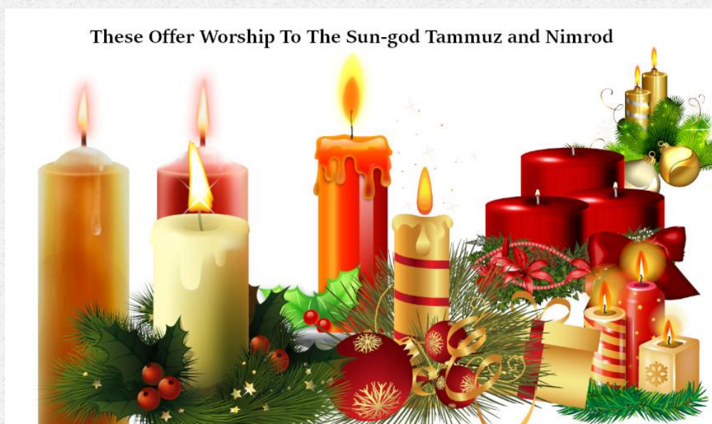
Figure 8: Setting up Christmas candles originates from sun god worship. This practice has nothing to do with the light of Jesus; it only gives worship to Tammuz and the pagan gods.

Represent the sun-god's newly born fire (see Figure 8). Pagans worldwide love and use candles in their rituals and ceremonies. Certain candle colours are also thought to represent specific powers. The extensive use of candles is usually a very good indication that a service is pagan. Candles on any Christmas thing you could think of actually represent sun-god's newly-born fire.