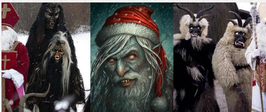
Figure 5: Christmas Krampus demons and saint Nicholas—worshipping God in a contrary way; this is idolatry and only triggers the anger of God.

Many people have attempted to look at Christmas from different views and perspectives. Unfortunately, these attempts have only created contradictions and conflicts with other parts of the word of God. For example, the same God who says learn not the ways of the heathen (JEREMIAH 10:2-6) is the same God saying you can worship me like the heathens worship their gods with trees decorated with silver and gold and lights, Yule log, mistletoe, etc.,—HOW CAN THIS BE?