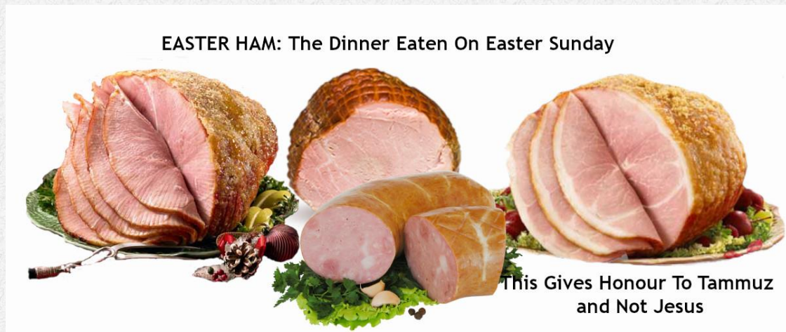
Figure 2: The practice of eating ham (pig’s meat) on Easter Sunday originated from the instruction given by Semiramis that people should eat pigs to honour Tammuz. This practice is offensive to God in twofold: (1) The practice itself is idolatrous and offensive to God (2): Eating pigs is forbidden ( Isaiah 66:17 and Leviticus 11 ).

Before Christ was even born, these practices were there: the pagans worshipped the resurrection of their son of a god known as Tammuz, and the mother goddess was worshipped as a fertility goddess . What we have today (Easter) is still the same thing that they were doing in the times of Semiramis; today, it only has a modern name and modern twists and turns. The same gods that they were worshipping in the time of Tammuz are the same gods we have today. The names of these gods have only changed with time but they remain the same.