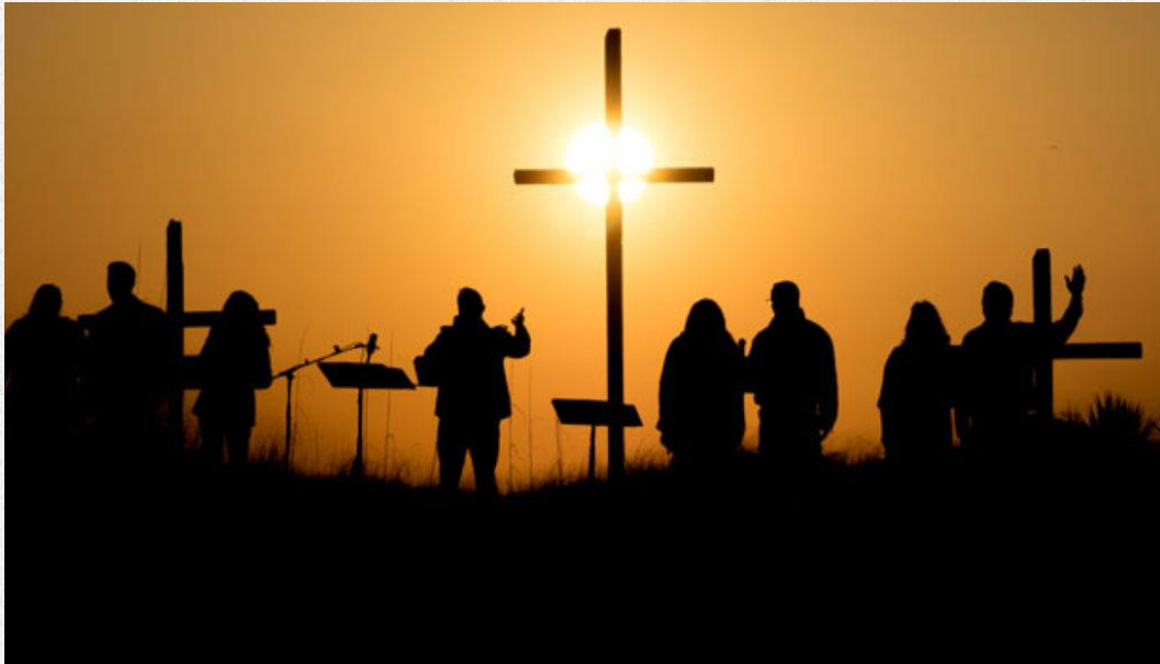
Figure 3: Easter sunrise service in modern times. This is sun worship rebranded as Christian, it has nothing to do with the resurrection of Jesus. The deception sold to people is that the rising sun symbolises Jesus rising from the dead. The Bible doesn't mention all these; they are commandments of men. They are abominations to God.

Easter sunrise service, as we know it today, is a pagan practice that predates Christ; the death and resurrection of Jesus Christ is just a sticker pasted on something that God hates. People do so supposedly thinking God will accept it—How can He when He clearly says do not mix My ways with false ways?