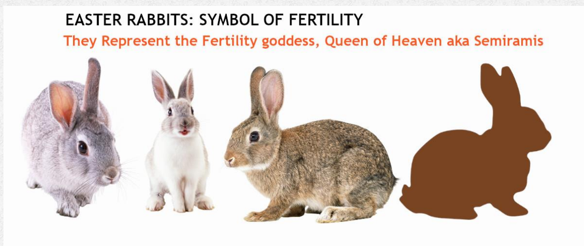
Figure 6: Rabbit is one of the most fertile animals on the earth and hence they are used as a symbol representing the fertility goddess—Semiramis aka Queen of Heaven. This is an abomination to the Lord.

Easter bunnies are symbols of fertility, referencing the mother goddess (see Figure 6 ). These practices and symbols representing them are not holy and are very offensive to God. Christians should stay clear away from these practices: Eating Easter ham commemorates the death of Tammuz and has nothing to do with Jesus (see Figure 2 ). Because Tammuz was killed by a wild boar, Semiramis (aka queen of heaven) commanded people to eat pig to commemorate Tammuz—who will you obey?