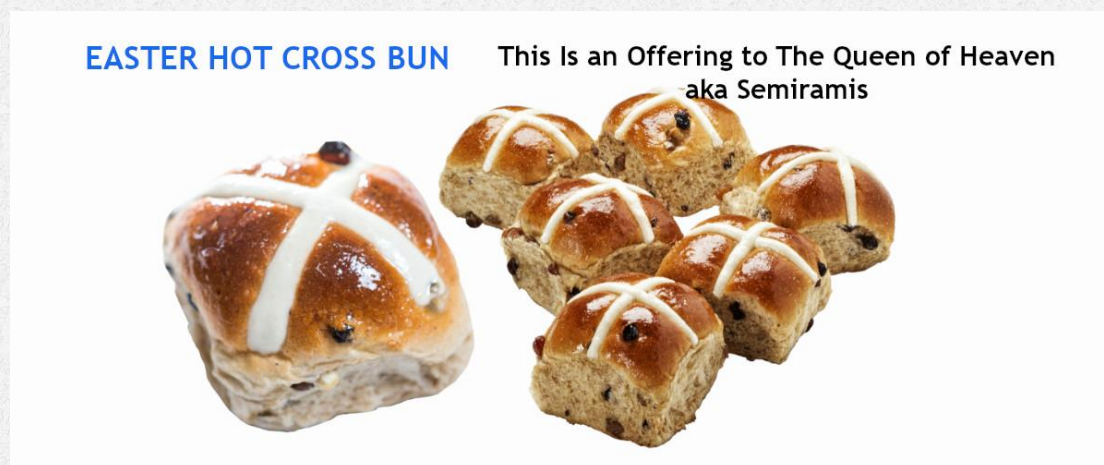
Figure 4: Easter Hot Cross Buns. This is the same cake they were baking to the queen of heaven; today, this abominable practice has been rebranded as something good but it is not.

People in those days were baking this to the Queen of heaven (aka Semiramis aka mother/wife of Tammuz—the false Babylonian Messiah). God hates this practice. This practice offers worship to the queen of heaven instead of the Most High God. Easter is from Ishtar—another name for Semiramis.