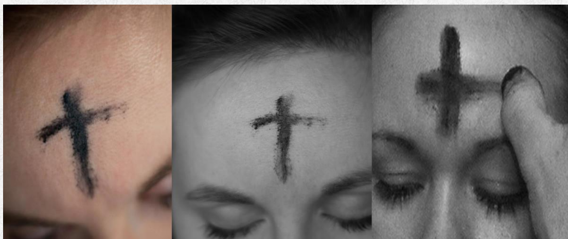
Figure 1: The practice of marking a cross on people's forehead in what is known as Ash Wednesday, supposedly thinking it is the cross of Jesus, is a practice that originated from the worship of Tammuz—it has nothing to do with Jesus or the cross He was crucified on. This practice is idolatrous and very offensive to God.

These worshipers meditate on the mysteries of Baal and Tammuz, and they make a sign of a cross on their foreheads or their right hands (see Figure 1 ). They also ate sacred cake marked with a cross on top—this latter became known as Easter Hot cross buns.