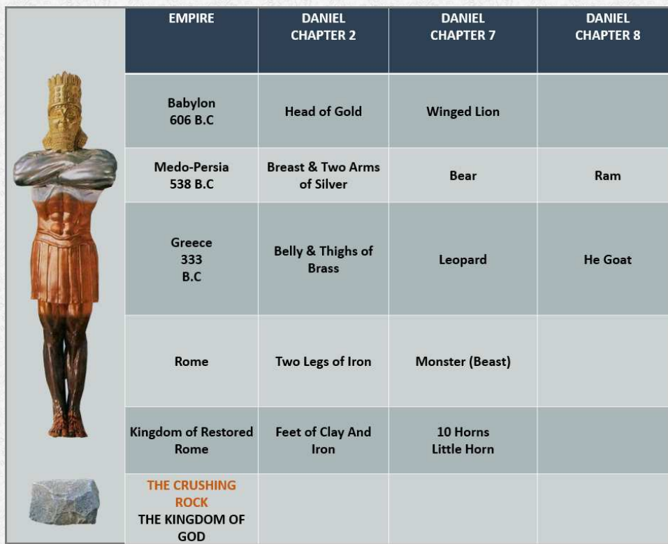
Figure 1: The statue in the dream of Nebuchadnezzar ( Daniel 2 ); Notice the succession of Kingdoms and the final Kingdom to be set up—the kingdom of God—and it will last forever.

Contrary to the false belief that the saints will be raptured away to escape the great tribulation, the saints will be around during the great tribulation and will be protected in the WILDERNESS.