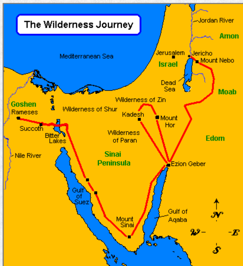
Figure 2: Map showing the wilderness where the children of Israel spent 40 years; this is the wilderness to flee to in the future when the time comes.

The above passage is talking about the journey of the children of Israel and how they encamped on edge of the wilderness; the wilderness here is also the wilderness of the future. The journey of the children of Israel through the wilderness—the wilderness where they spent 40 years before moving into the promised land—this is wilderness!