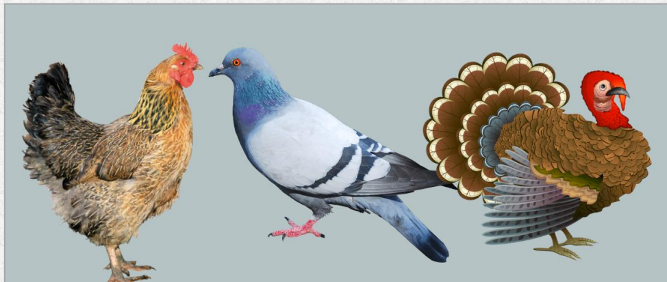
Figure 1: Examples of clean birds; not exhaustive; these may be eaten.

Sagehen, Chicken, Turkey, Grouse, Partridge, Pheasant, Pigeon, Prairie chicken, Ptarmigan, Quail.