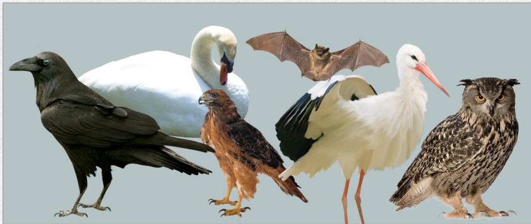
Figure 2: Examples of unclean birds; not exhaustive; these may not be eaten.

Eagle, vulture, ossifrage, ospray, kite, owl, hawk, cuckow, cormorant, swan, pelican, stork, heron, lapwing, bat