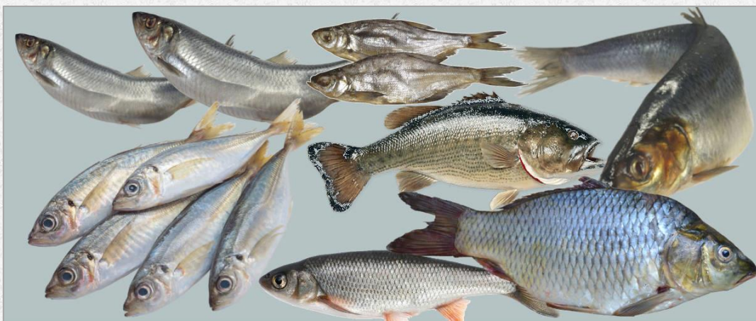
Figure 5: Examples of clean seafood—fish with fins and scales; these may be eaten.

Anchovy, Barracuda, Bass, Black Pomfret, Bluefish, Bluegill, Carp, Cod, Crappie, Drum, Flounder, Grouper, Grunt, Haddock, Hake, Halibut, Hardhead, Herring, Kingfish, Mackerel, Mahimahi, dolphinfish (not the mammal dolphin), Minnow, Mullet, Perch, Pike, Pollack, Rockfish, Salmon, Sardine, Shad, Silver hake, Smelt, Snapper, Sole, Steelhead, Sucker, Sunfish, Tarpon, Trout, Tuna, Whitefish.