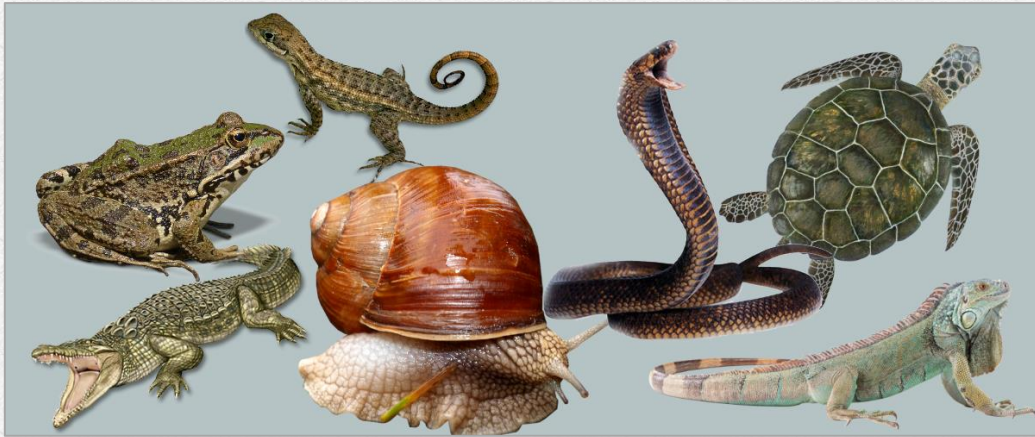
Figure 7: Examples of reptiles—unclean; not exhaustive; these may not be eaten.