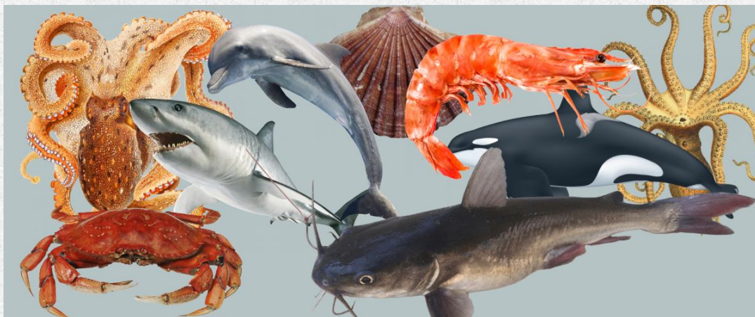
Figure 6: Examples of unclean seafood—without fins and scales; not exhaustive; these may not be eaten.

Shellfish (Abalone, Clam, Crab, Crayfish, Lobster, Mussel, Prawn, Oyster, Scallop, Shrimp) Soft body (Cuttlefish, Jellyfish, Limpet, Octopus, calamari), Sea mammals (Dolphin, Otter, Porpoise, Seal, Walrus, Whale), Fish with no fins and no scales (Bullhead, Catfish, Eel, European Turbot, Marlin, Paddlefish, Sculpin, Shark, Stickleback, Squid, Sturgeon (includes most caviar), Swordfish)